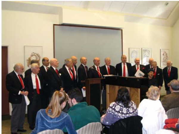
The Hoot Owls serenade on Superbowl Sunday