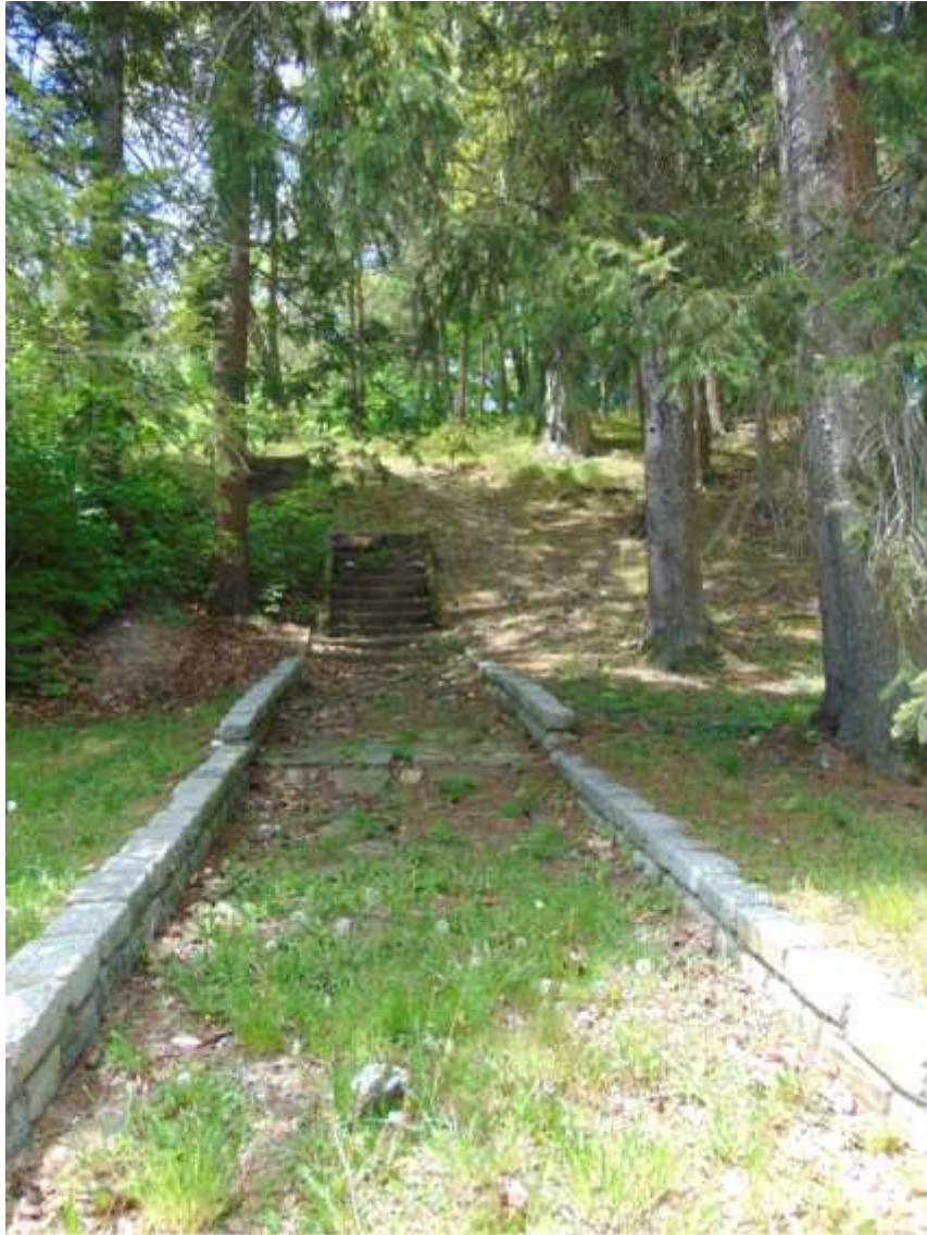
Photograph 10 , Path looking west