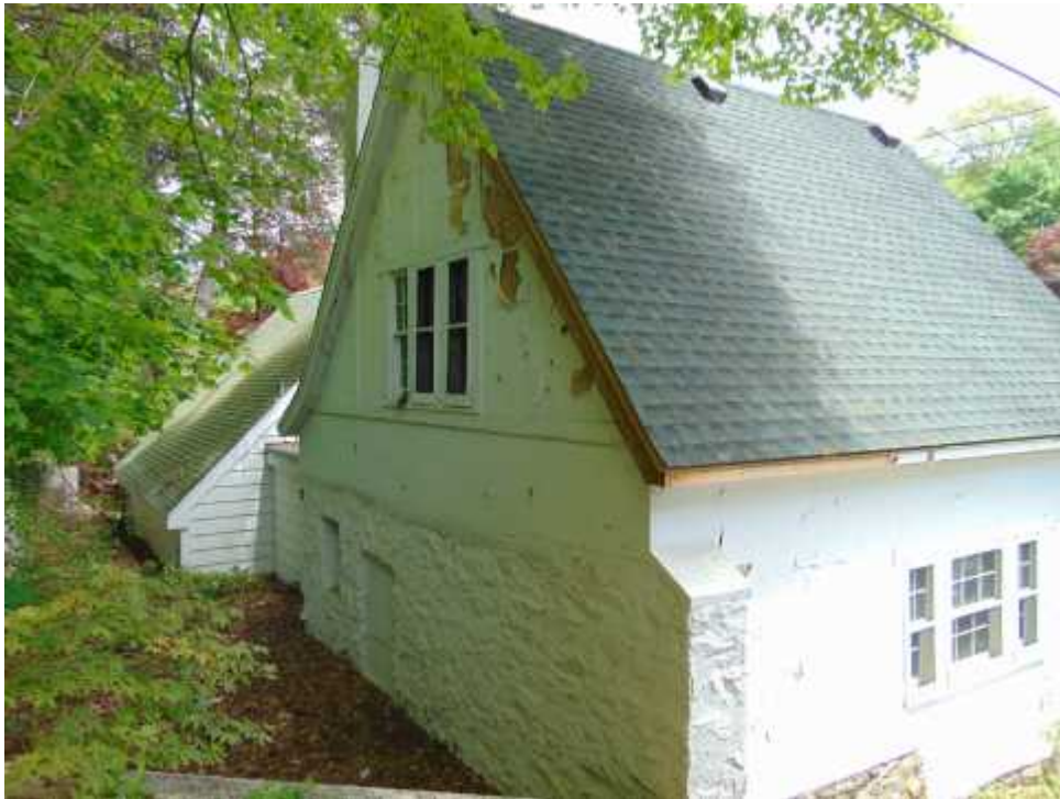
Photograph 6 , Façade, west elevation, looking northeast