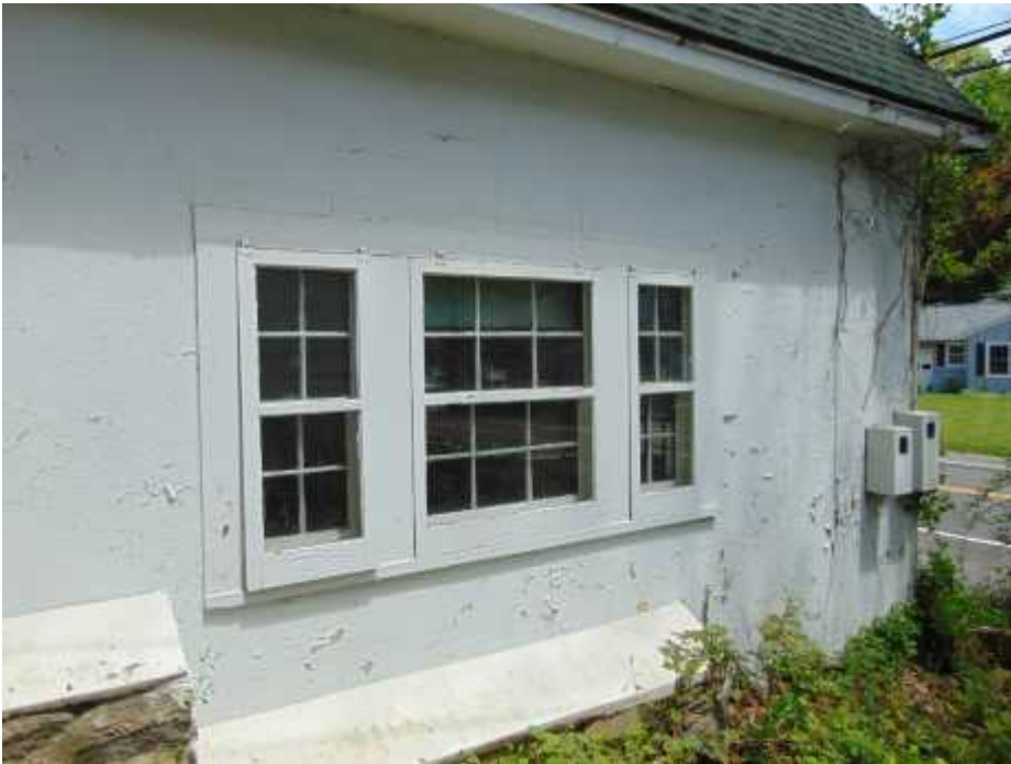
Photograph 4 , Façade, south elevation, looking northeast