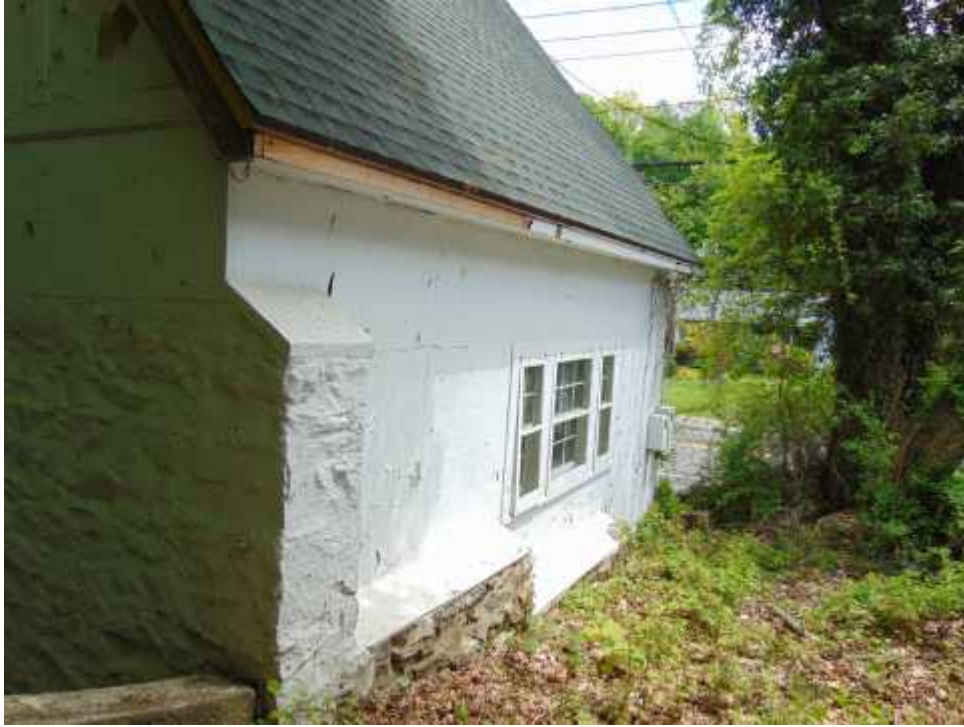
Photograph 5 , Façade, south elevation, looking northeast