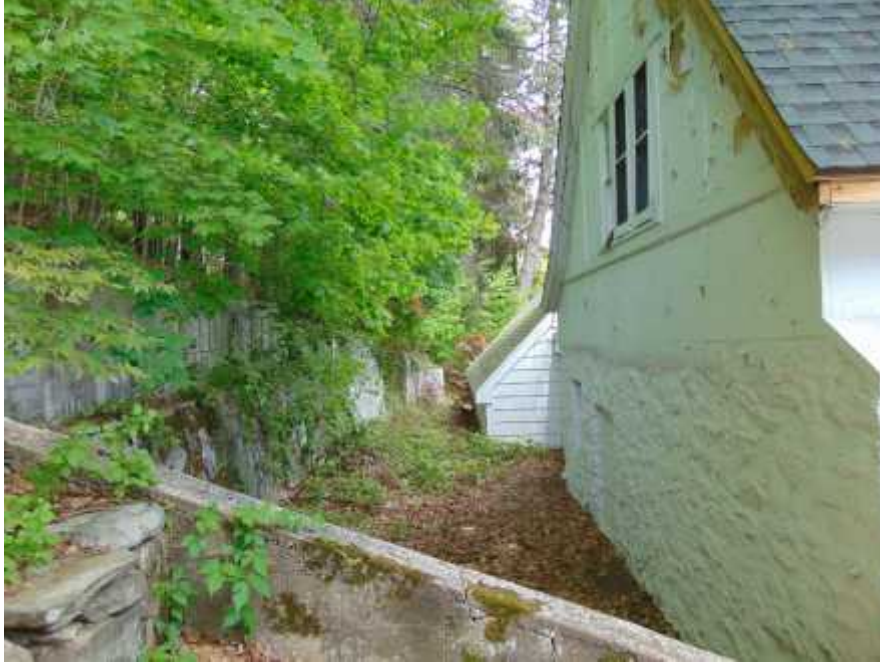
Photograph 7 , Façade, west elevation, looking north