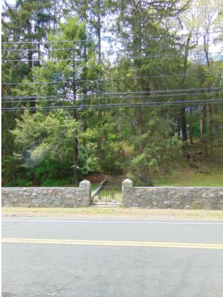
Photograph 9 , Stone Wall and Gate, with path, looking west