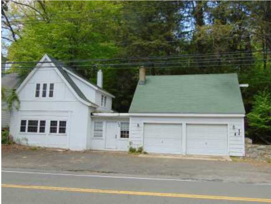
Photograph 1 , Façade, east elevation, looking west