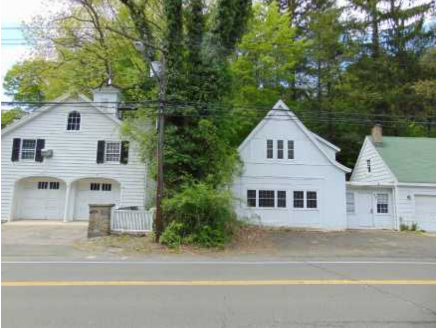
Photograph 3 , Façade, east elevation, looking west