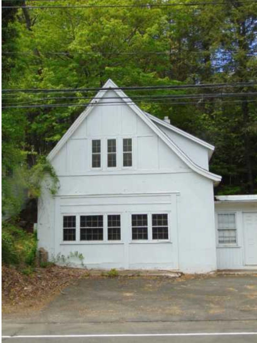
Photograph 2 , Façade, east elevation, looking west