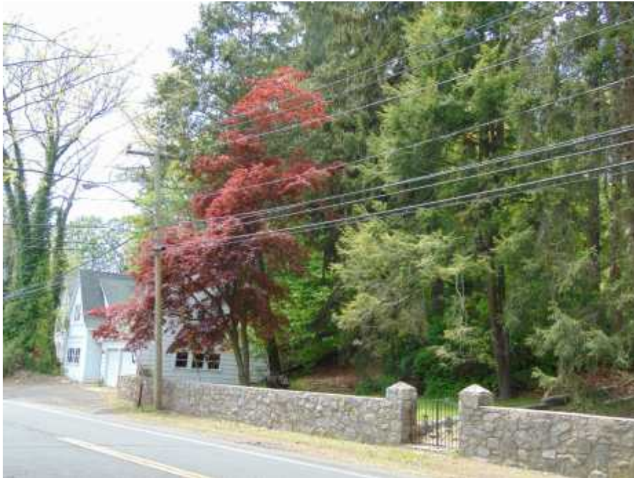
Photograph 8 , Stone wall and garage. View from north, looking southwest