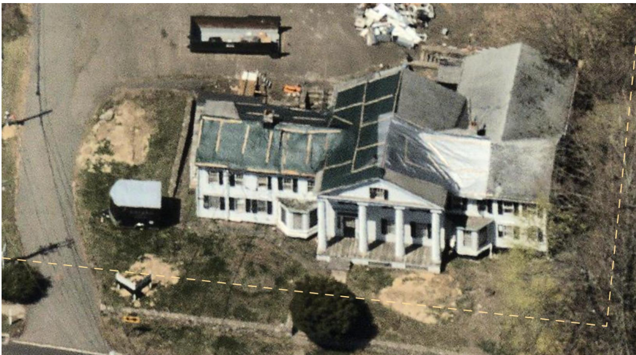
Primary building as depicted on Nearmap dated 4/17/2025

A Pre-Application meeting was requested for a potential Text Amendment to adaptively reuse the building to create multi-family dwelling units. The Public Meeting was held on 2/28/22 where positive feedback was provided, here (1:49-26:10).