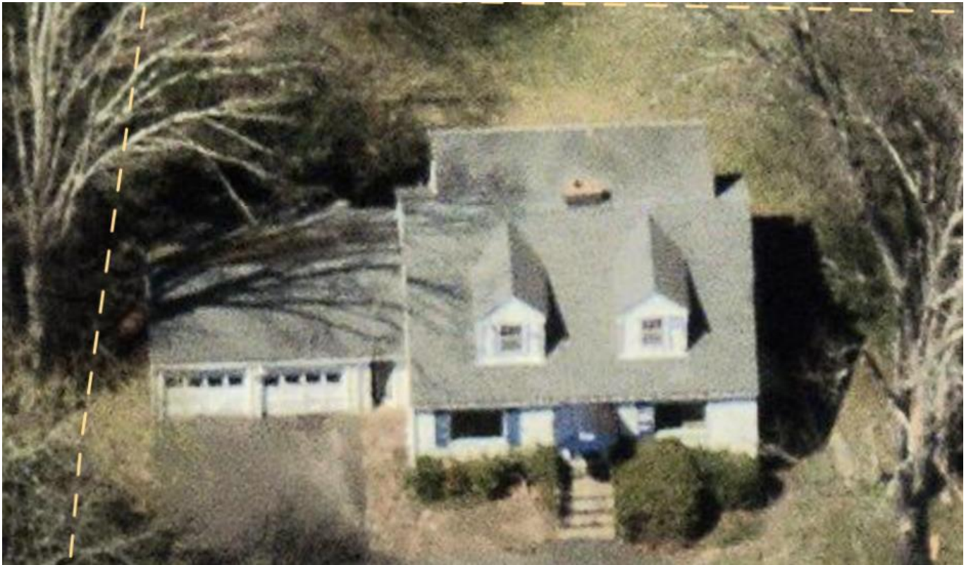
Secondary building as depicted on Nearmap dated 4/17/2025