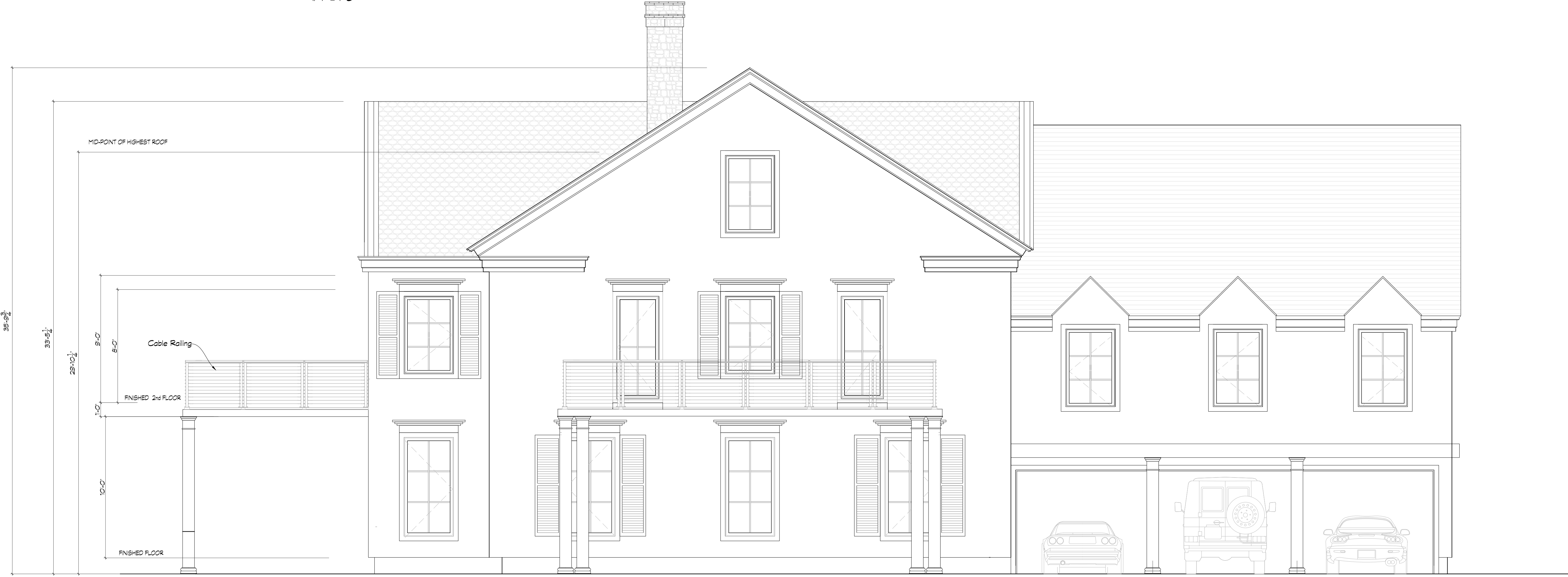
2 EAST ELEVATION A-8 1/4" = 1'-0"

2/17/26 : Added Proposed elevation of 41.3