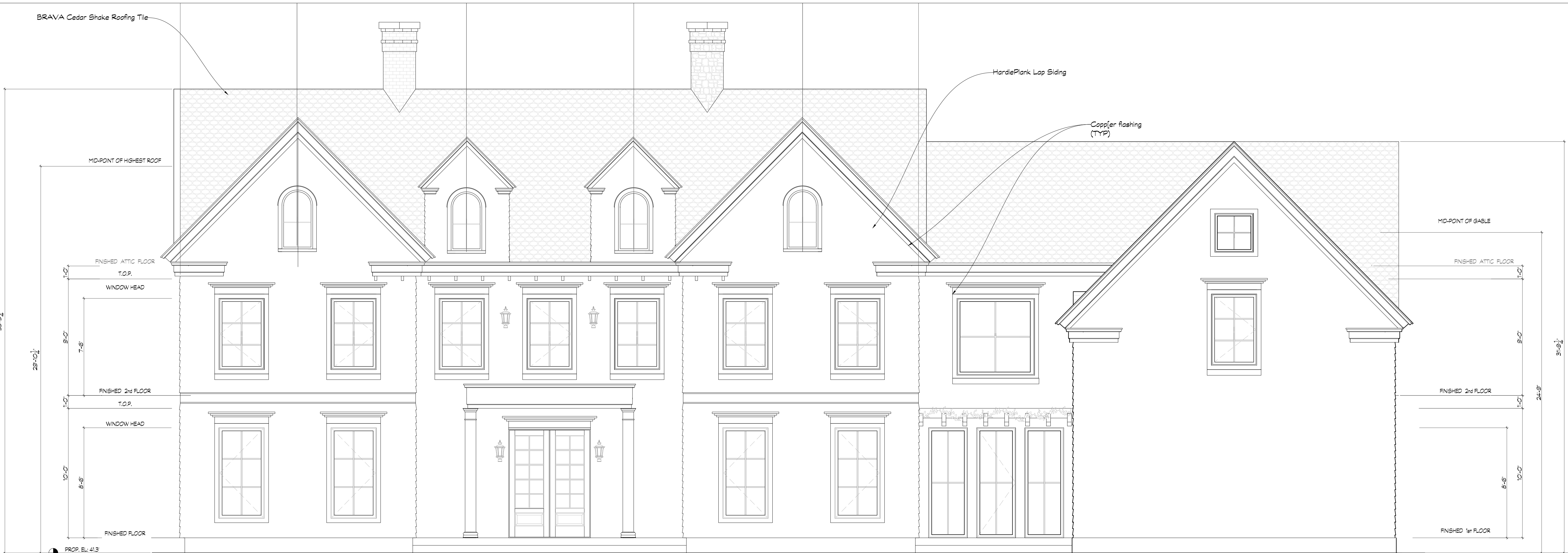
1 FRONT ELEVATION (NORTH) A-8 1/4" = 1'-0"