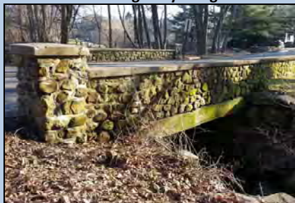
Cross Highway Bridge